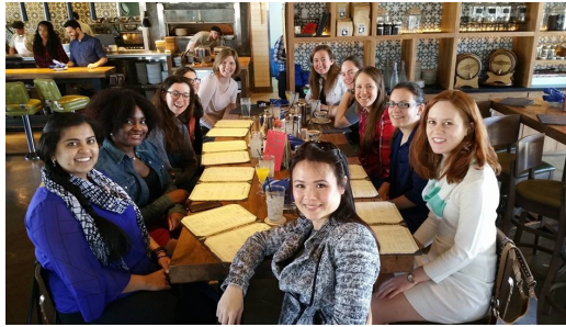
Dallas SWE Social Brunch