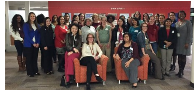
Dallas SWE Professional Development Meeting