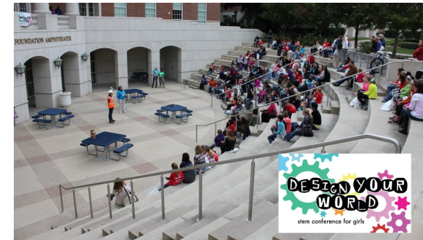
Dallas SWE members show students what engineers wear to work during the fashion show at Design Your World

Design Your World is Dallas SWE's signature outreach event. Twice a year, we partner with local college SWE sections to host this event. Girls come from all around DFW to participate in hands-on engineering activities, learn about engineering, and watch an engineering fashion show!