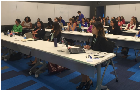
SWE members participate in discussion at a Professional Development Meeting